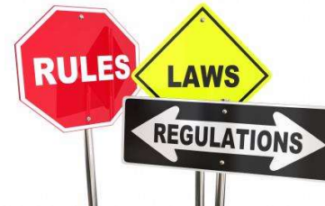
Rules & Regulations